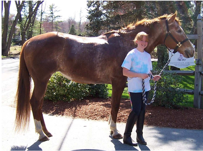
Rosie and friend, spring 2009

Rosie has experienced many changes during her time in New England. She is a beautiful, intelligent horse who has not had much schooling nor worked with very many riders. At Plum Grove Equestrian Center, we are able to offer Rosie an opportunity to work with thoughtful, caring riders who can both learn from her and offer her a chance to become a more flexible and trusting horse.